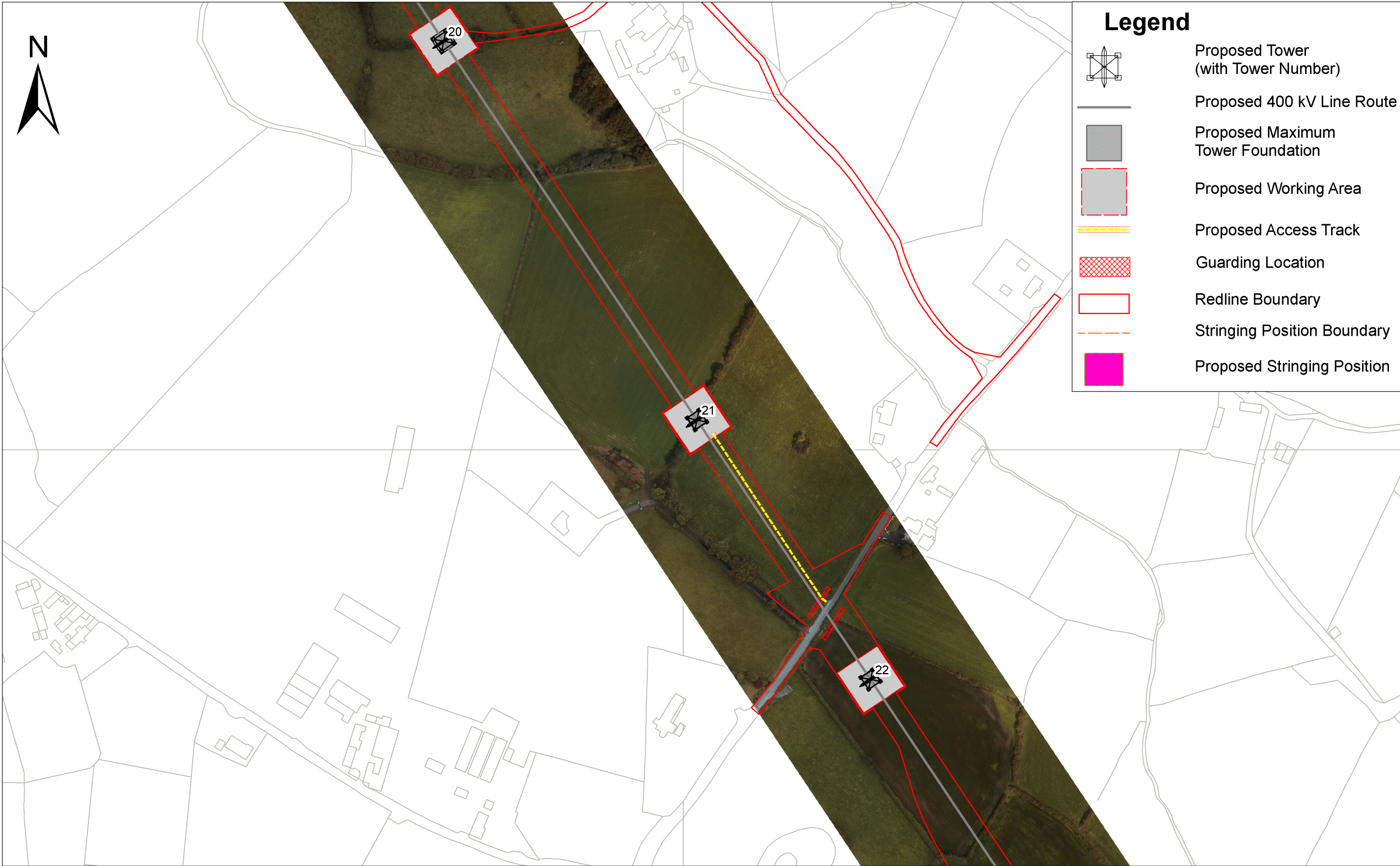
View 1: 1/2,500